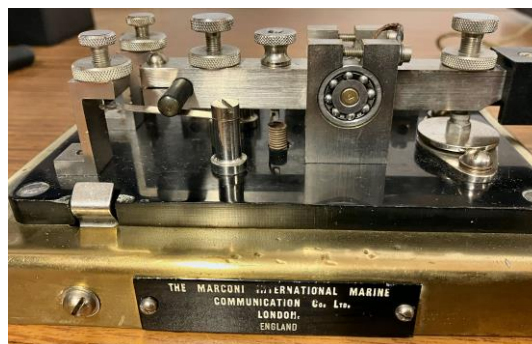
Marconi 365A Key - and a rare Rugby Key