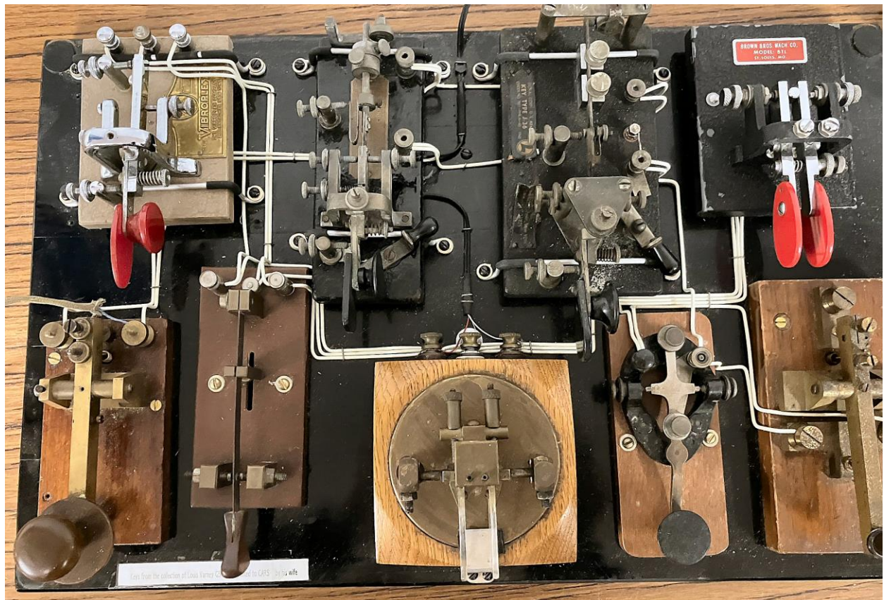
Louis Varney G5RV Morse Key collection – assembled by Colin G0TRM