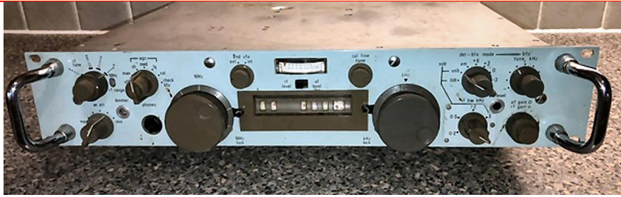
Racal 1217 Receiver